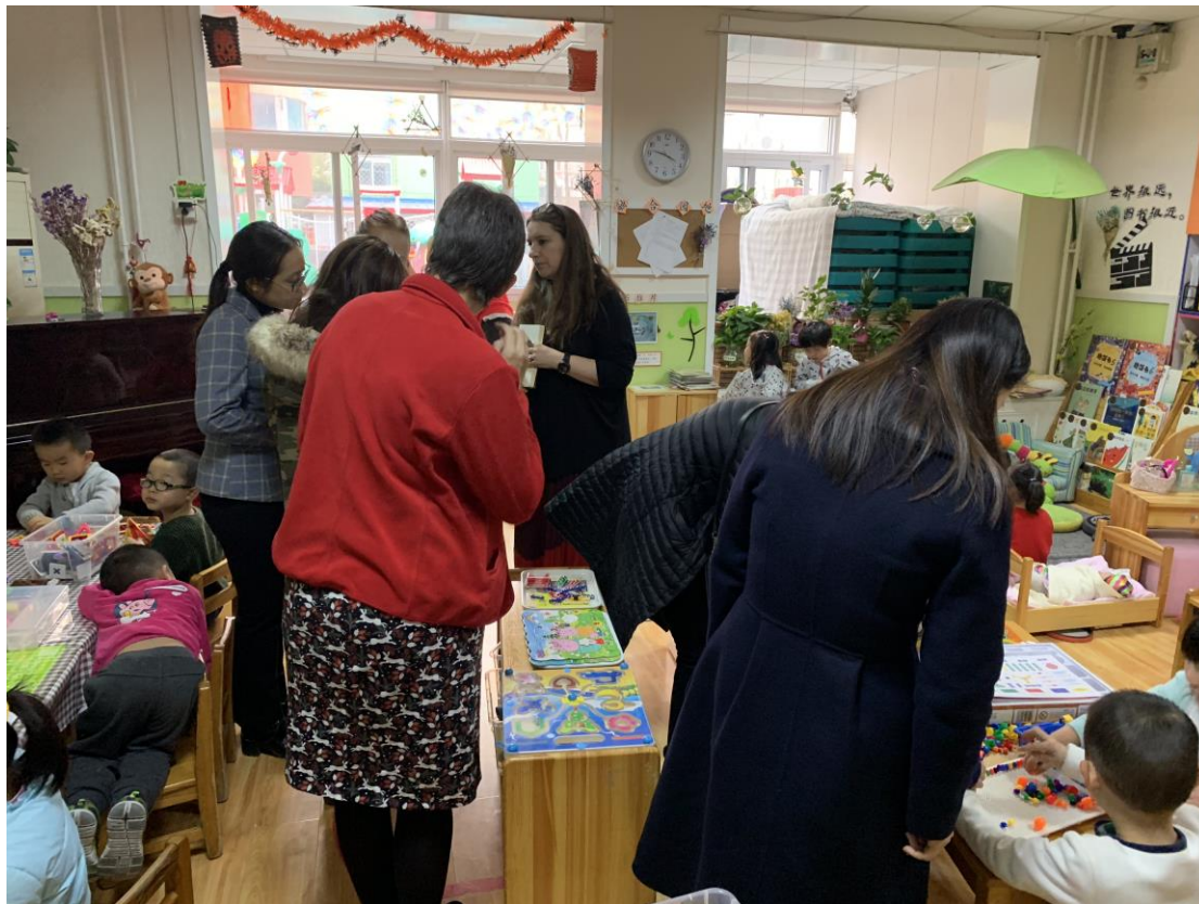
observing class activity