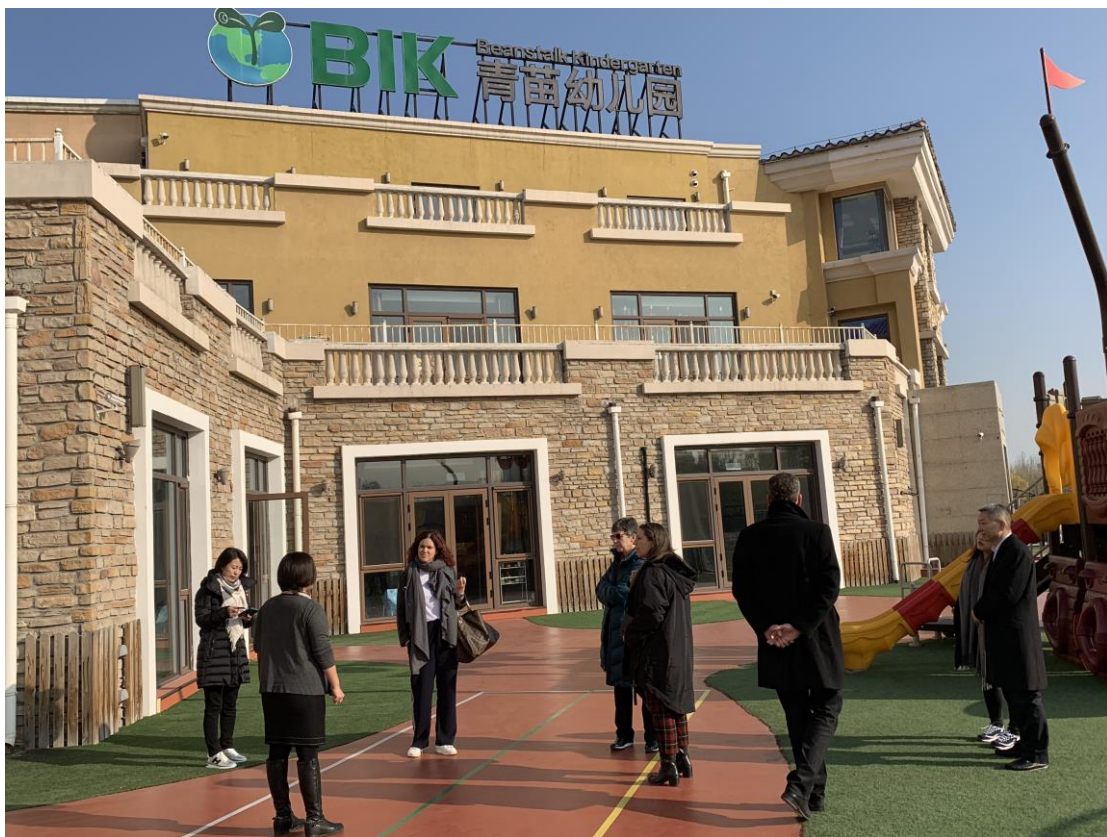
visiting indoor area and facilities