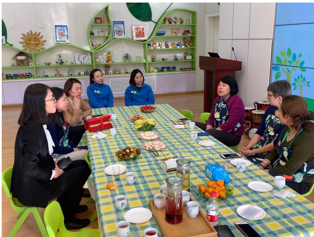
Discussion and exchange