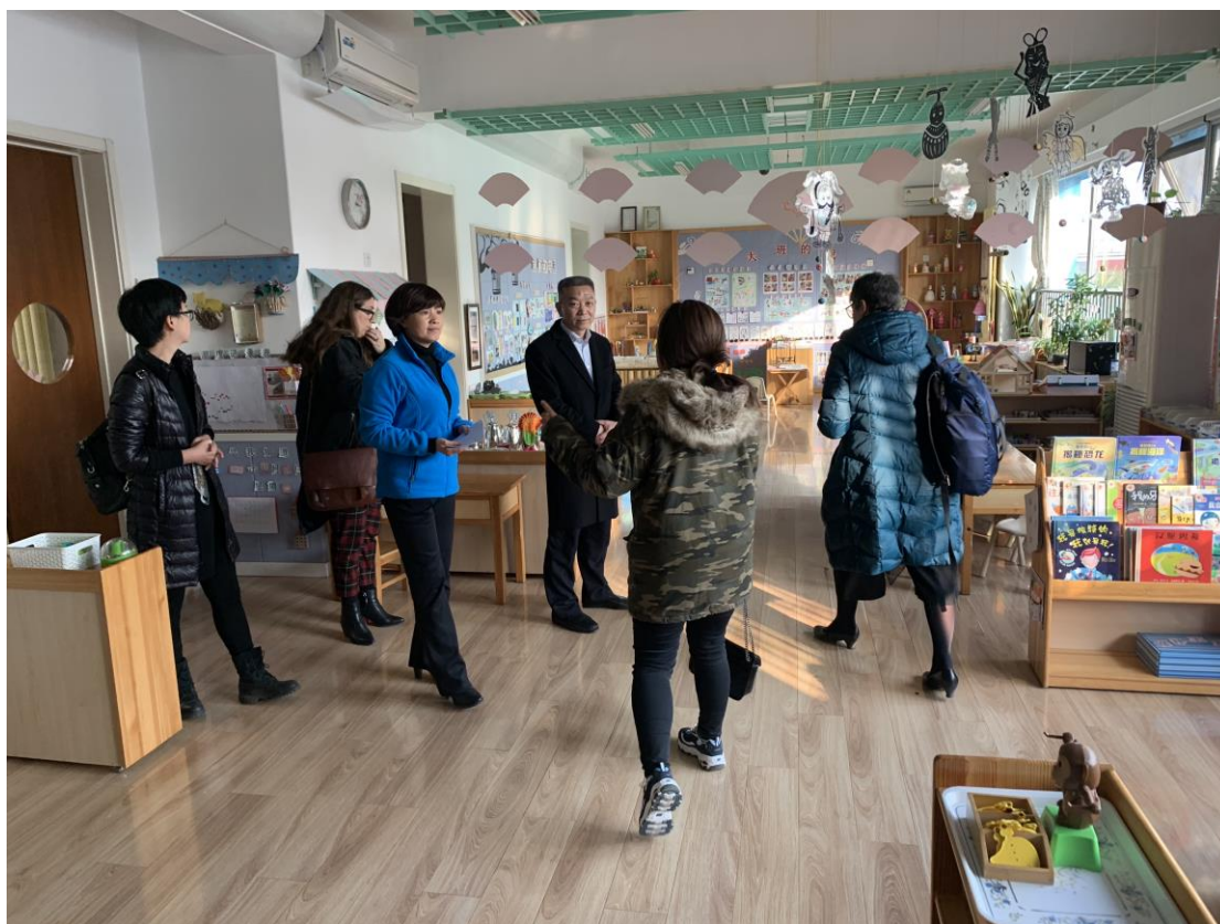
visiting indoor area/facilities