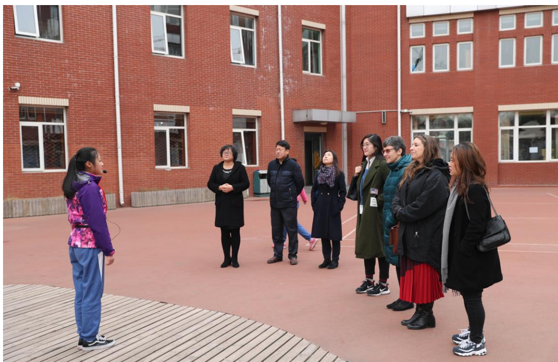
Students of the school giving introduction of the school in English