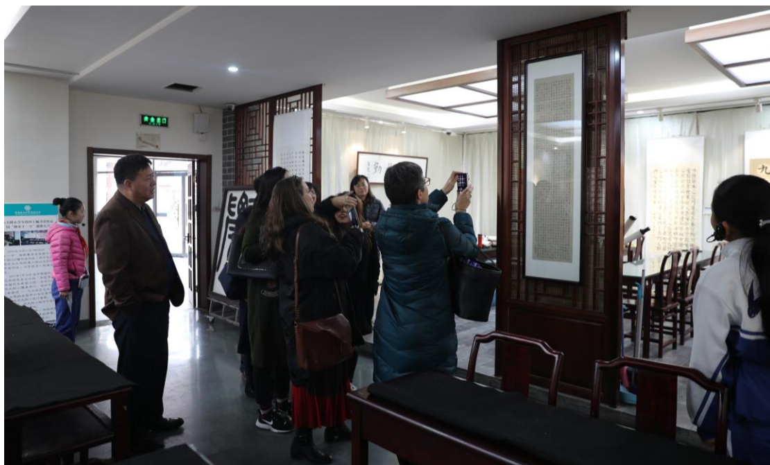
Admiring students' and teachers' calligraphy work