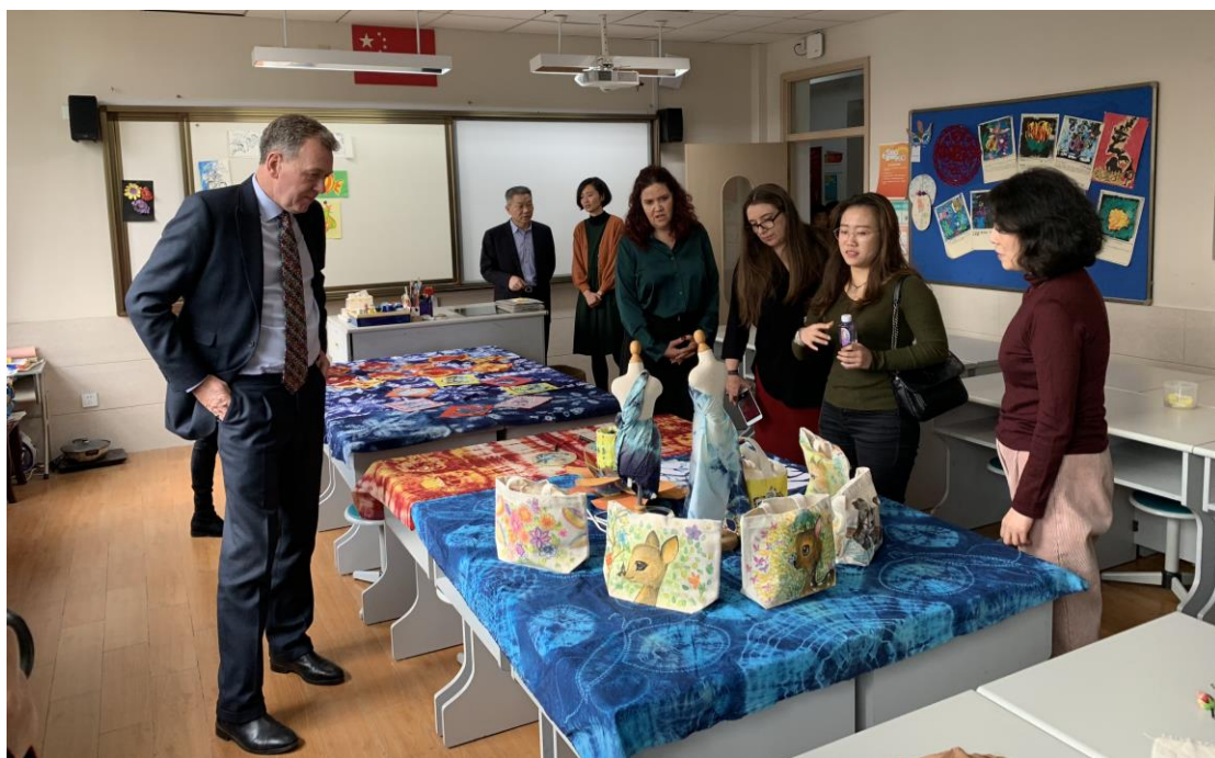
The delegation visited special course-- tie-dyed