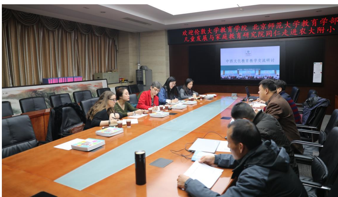
Discussion with the school headmaster and backbone teachers