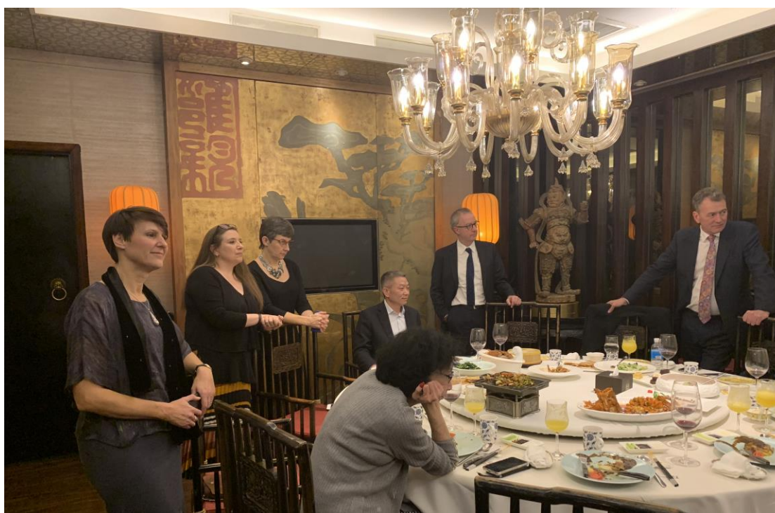
traditional Chinese folk music performance after dinner