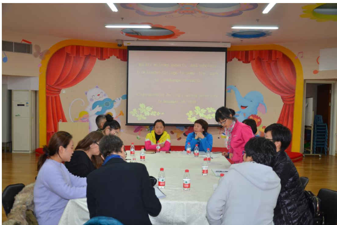
Discussing with the head teacher and backbone teachers