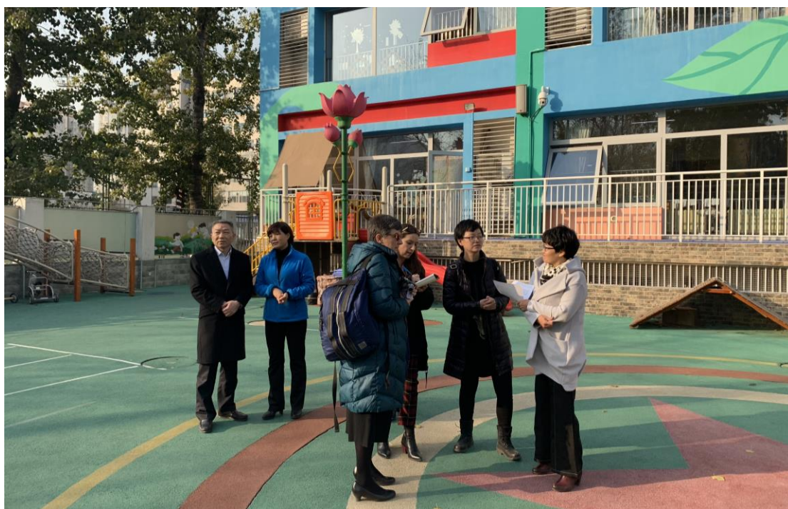
visiting outdoor area