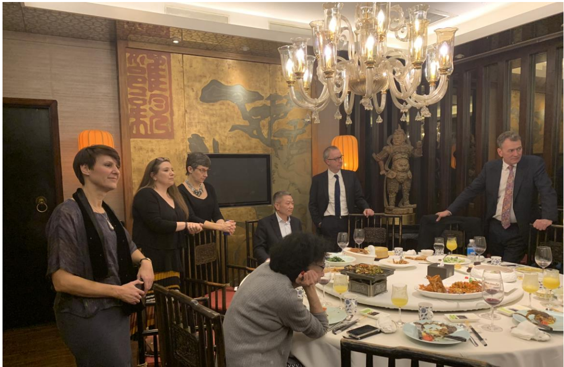
traditional Chinese folk music performance after dinner