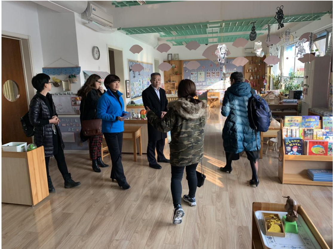
visiting indoor area/facilities