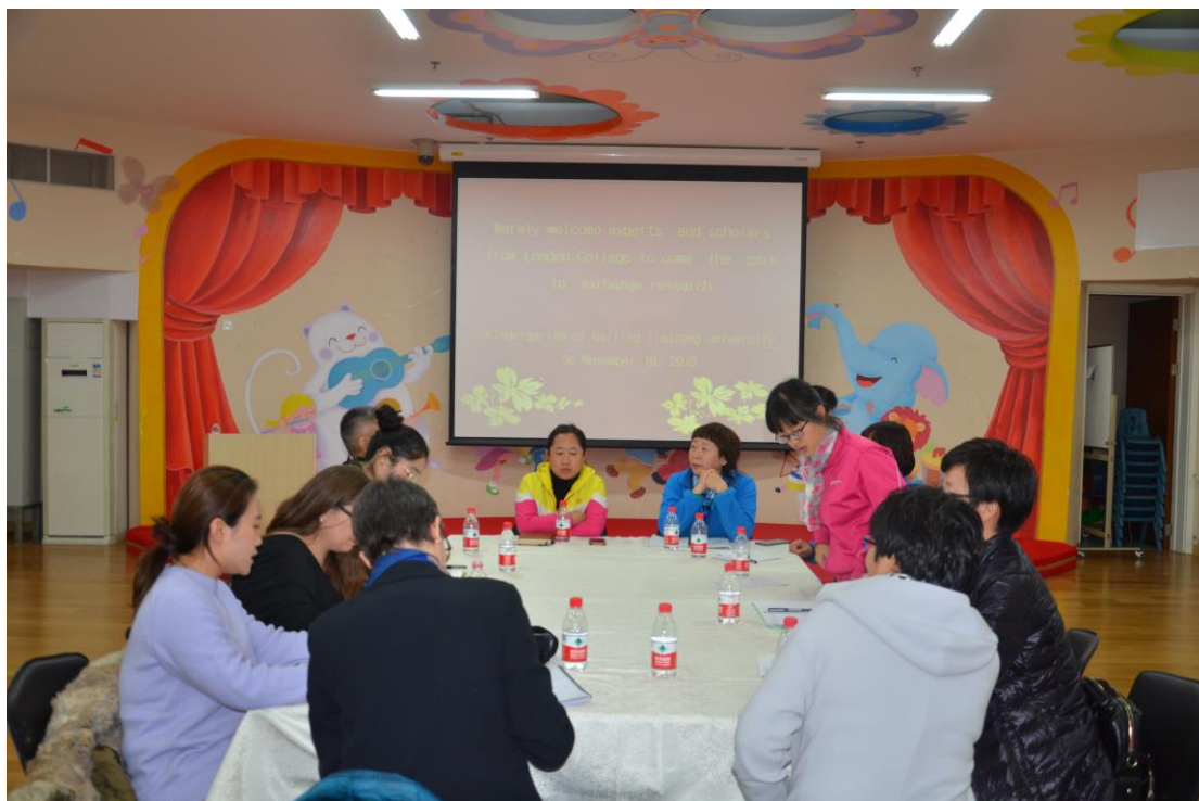
Discussing with the head teacher and backbone teachers