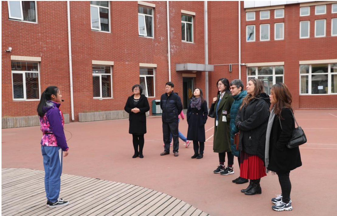
Students of the school giving introduction of the school in English