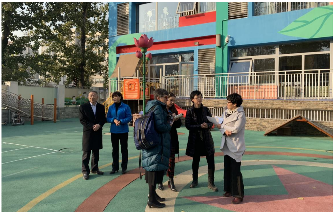
visiting outdoor area