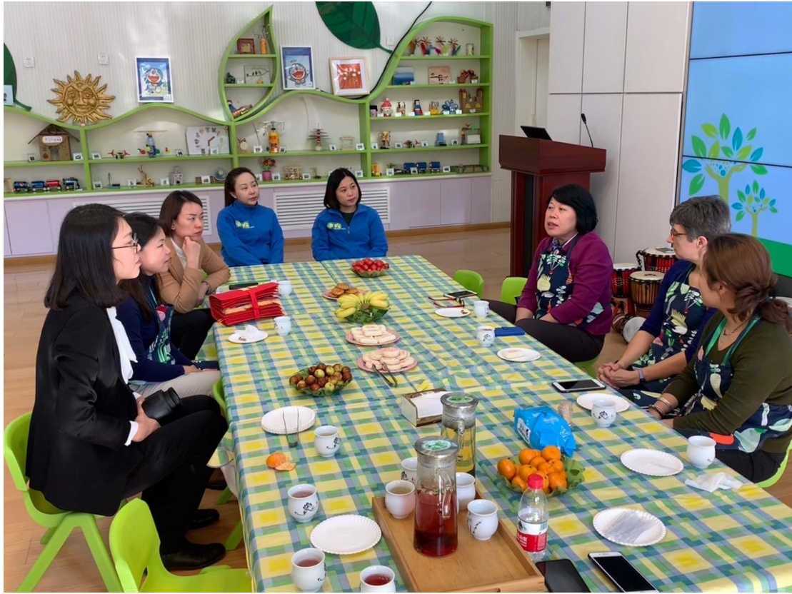
Discussion and exchange