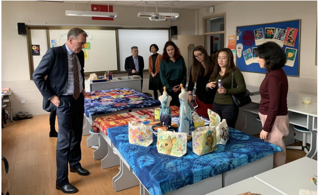
The delegation visited special course-- tie-dyed