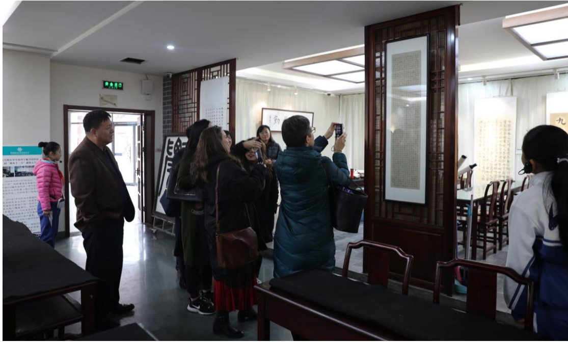
Admiring students' and teachers' calligraphy work